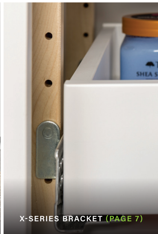
X-SERIES BRACKET (PAGE 7)