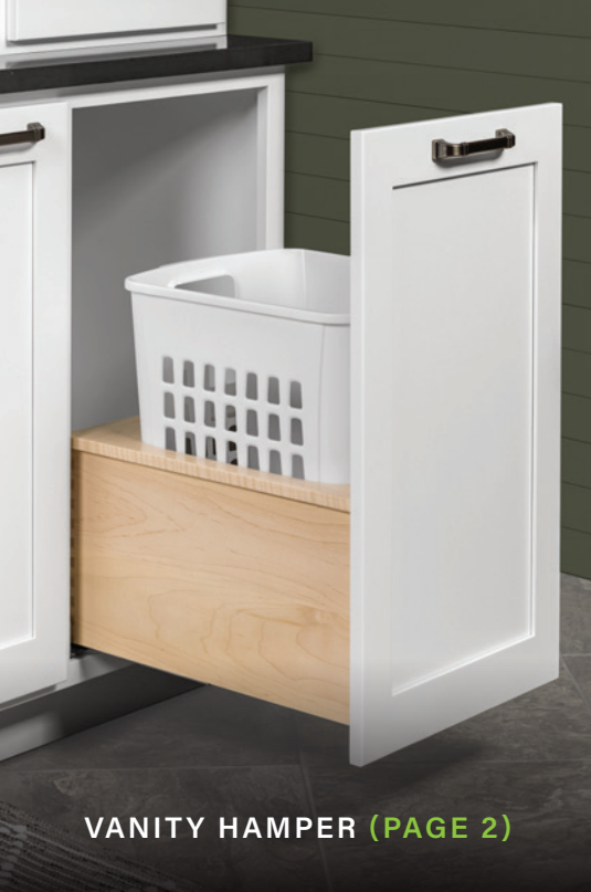
VANITY HAMPER (PAGE 2)