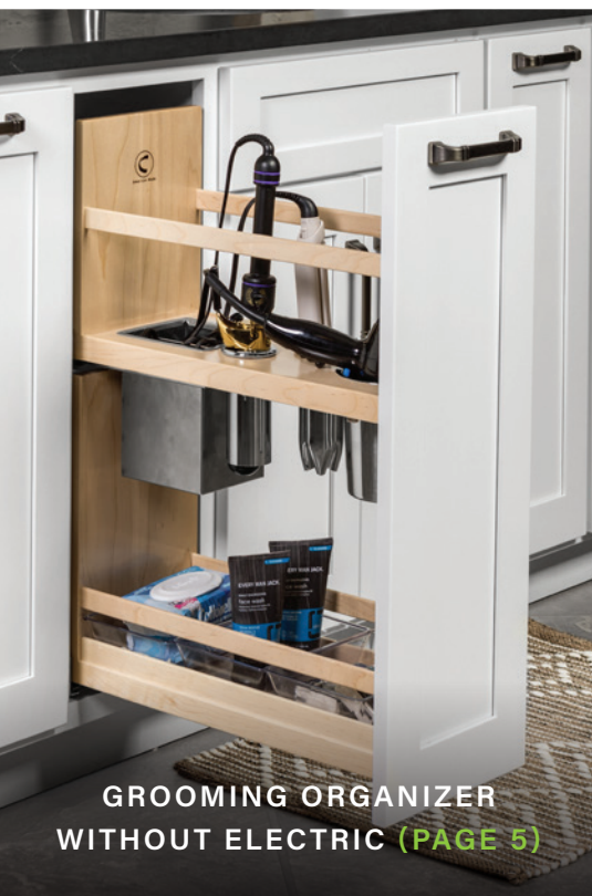
GROOMING ORGANIZER WITHOUT ELECTRIC (PAGE 5)