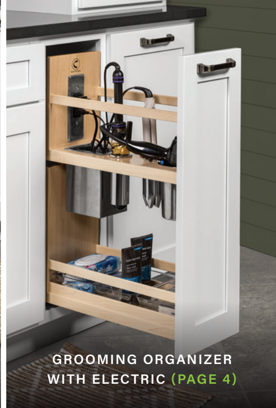
GROOMING ORGANIZER WITH ELECTRIC (PAGE 4)