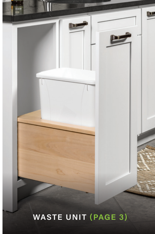
WASTE UNIT (PAGE 3)