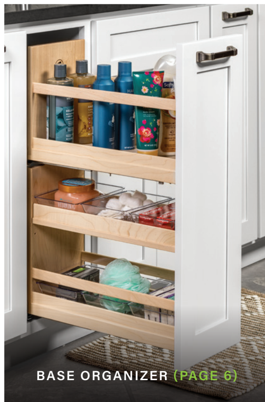
BASE ORGANIZER (PAGE 6)